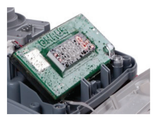
Inside PCBA Silicon Glue Sealing